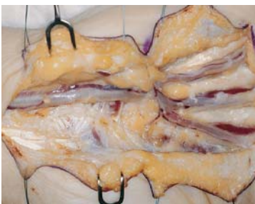
The wide opened Guyon's loge and hollow hand with N. ulnaris and A. ulnaris, which then form the superficial palmar arch.